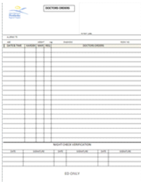
New single page form