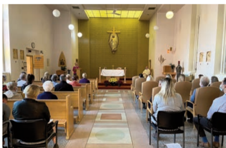
The existing 3rd floor Chapel